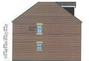
Side Elevation SCALE 1:50